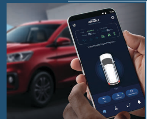
Connected Car Technology with Suzuki Connect Always stay connected with your car.