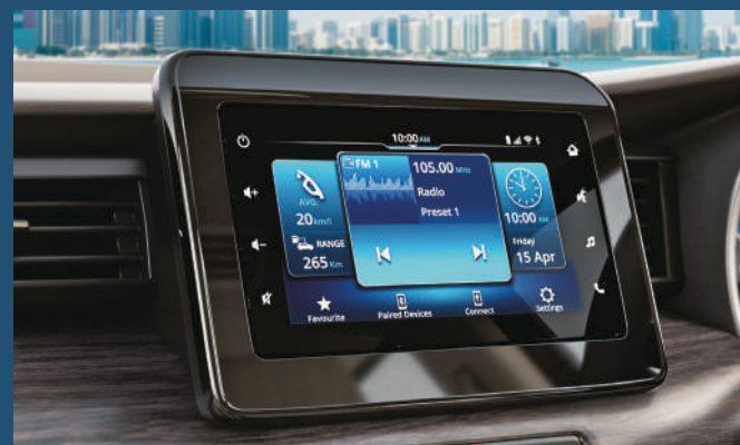
17.78cm Smartplay Pro Connect with your world with just a voice command - "Hi Suzuki".