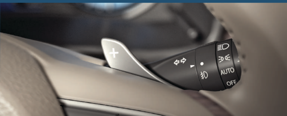
6-Speed AT with Paddle Shifters Surge ahead by engaging the smart paddle shifters.

● Togetherness, driven by technology. The Ertiga is equipped with state-of-the-art technology to add more fun to your moments of togetherness.