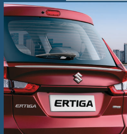
New Back Door Garnish with Chrome Insert Let those second looks chase you.