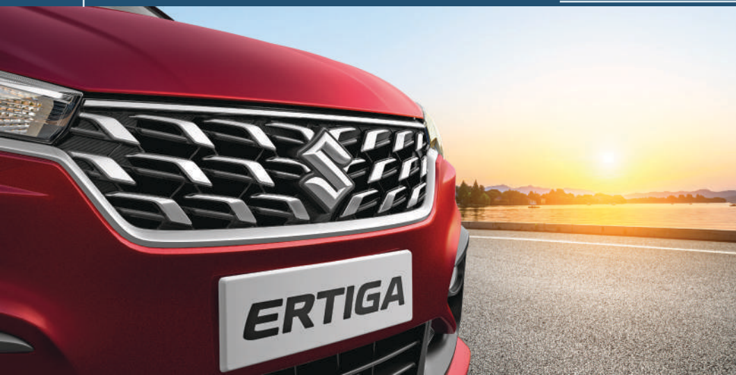
Dynamic Chrome Winged Front Grille The most stylish way to make an entrance.

● Elegant from every angle, the Ertiga is designed to bring out the stylish side of togetherness.