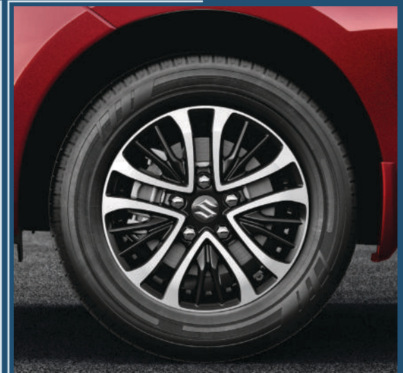
Machined Two-Tone Alloy Wheels Make a statement, every time.